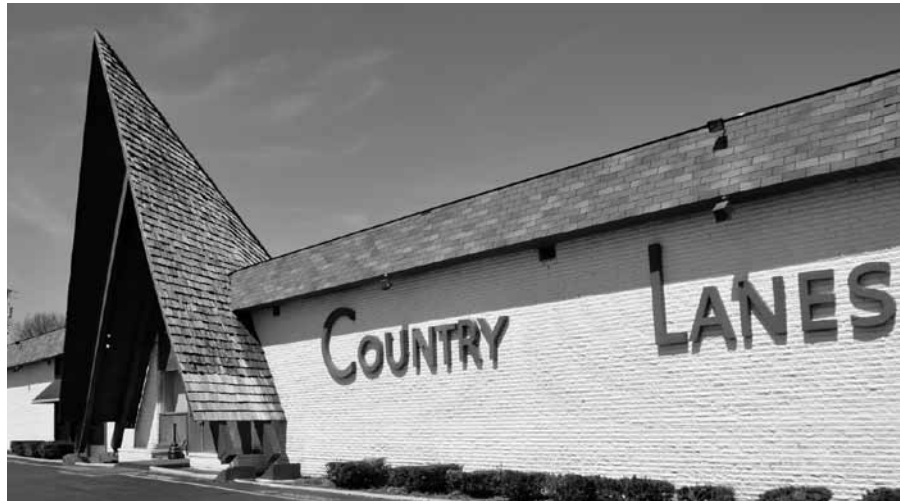
Country Lanes on Nine Mile Road in Farmington Hills

Included in the $20 entrance fee was a donation for charity; three games; shoes; pizza, pop and cookies for lunch, and loads of prizes.