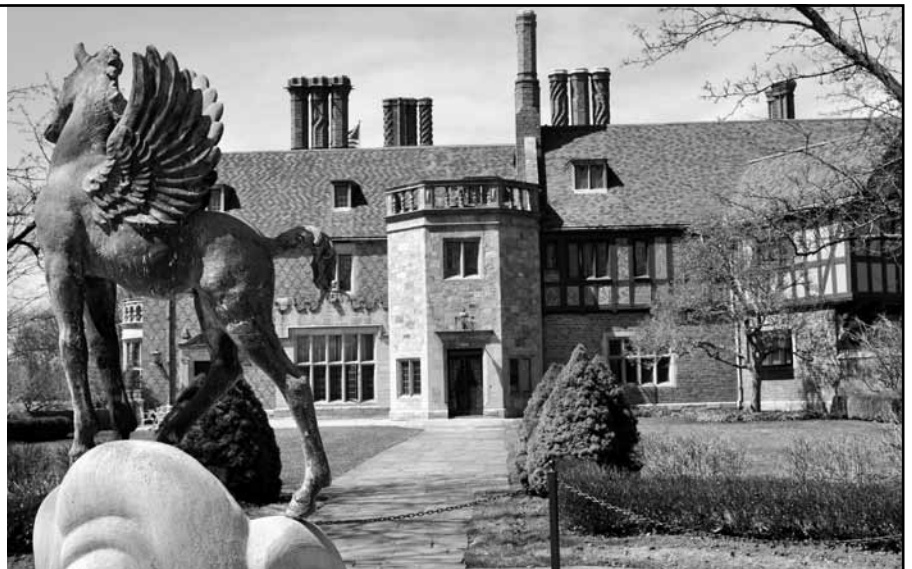
"Pegasus on Mount Helicon" sculpture on the east side of the mansion was created by Avard Fairbanks, who also designed the original Dodge Ram hood ornament.