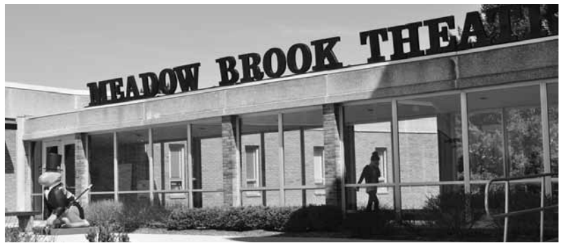
Retiree Association members saw "Ding Dong" at the Meadow Brook Theater

Following the tour, a delicious lunch was served in the Christopher Wren dining room, which provided a beautiful setting for food and conversation.