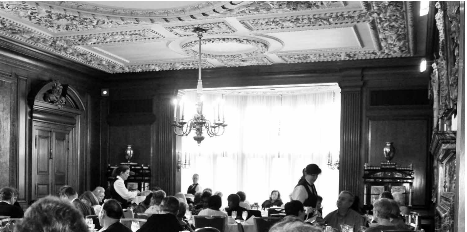
The ornate Christopher Wren dining room provided a beautiful setting for lunch.